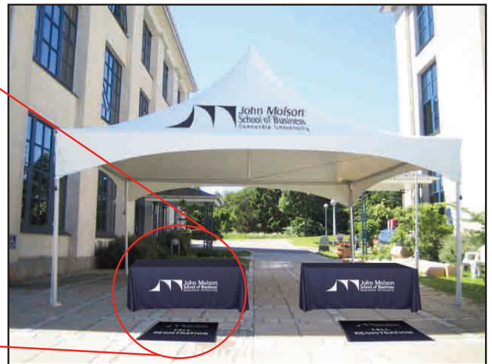
Great space definition for registration lines.